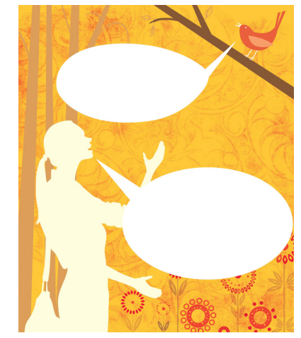
ILLUSTRATION BY Mark Hoffer/Fort Worth Star-Telegram